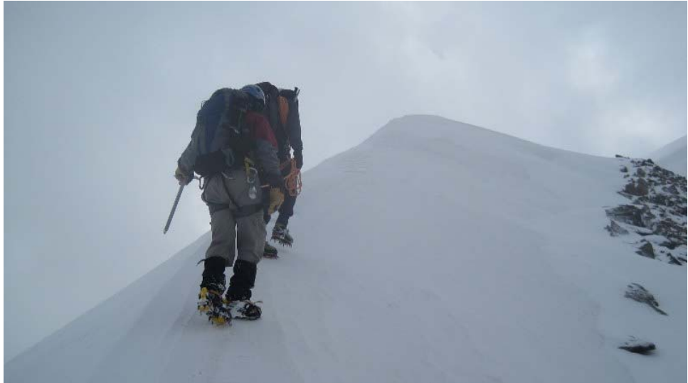
The summit ridge of Morteratsch.

We were first to summit and had a great climb."