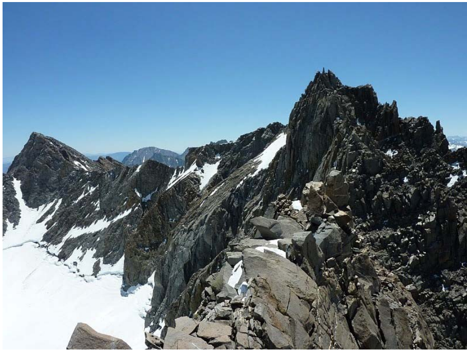
Palisades July 2011