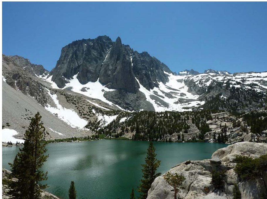
Snowy above Second Lake July 2011 - Pic Courtesy of Bill Brougher