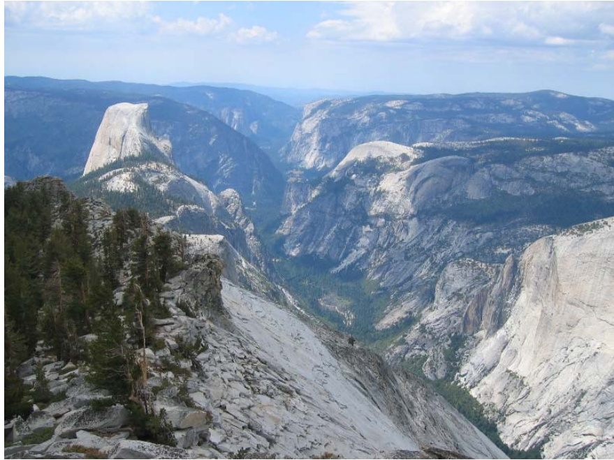
Sweeping Yosemite views!