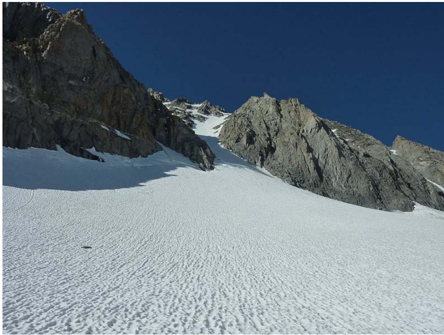
Thunderbolt Glacier July 2011