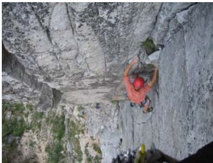
Lovers Leap Awesomeness!